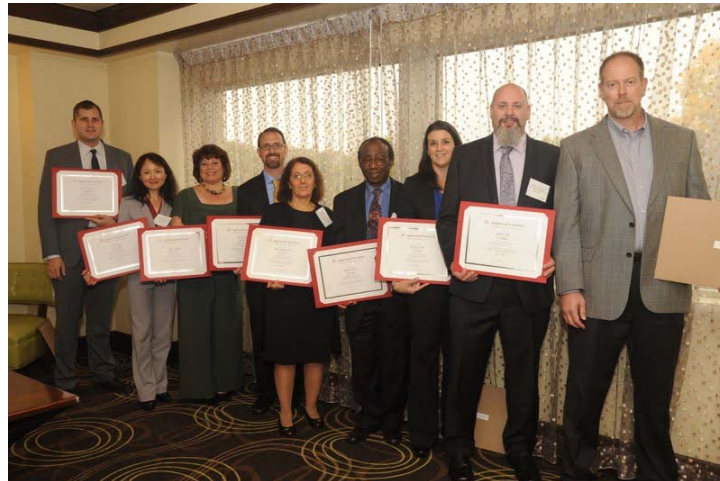
Congratulations to our new Designees!